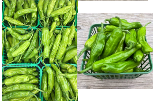
PEPPERS - SHISHITO (QUART)